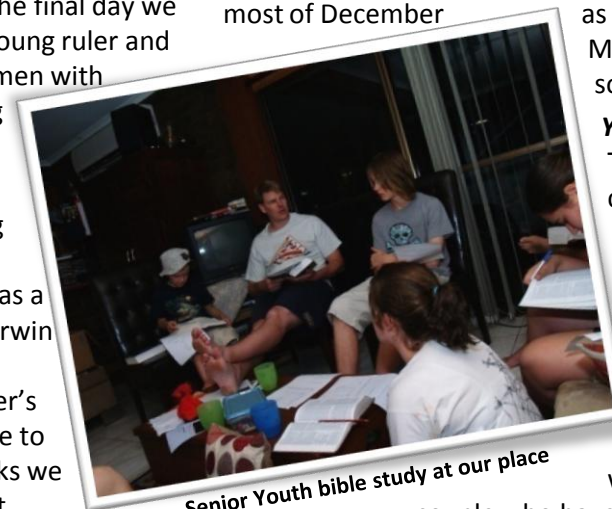
Senior Youth bible study at our place

The senior group continues to meet at our house on Monday nights. We have been studying Hebrews, which has raised all sorts of great questions. Next week we farewell the