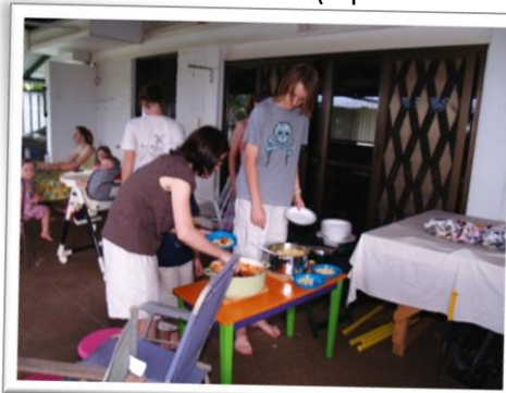
Dinner with youth on Monday nights

Last week I spent 3 full days in Scripture seminars for