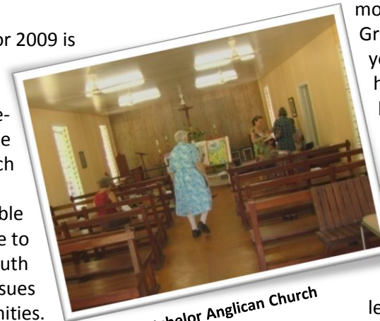
Batchelor Anglican Church

In 2009 I will be involved with Katherine Christian Convention (2-4 May) planning and co-ordinating a youth programme with a mission team from Sydney (for anyone interested contact Youthsurge for information). There could be up to 100 indigenous